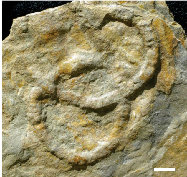
Figure 2. Slab with holotype of Parapsammichnites pretzeliformis from the Urusis Formation. Scale bar is 1 cm.

Sandstone bases are locally covered by tool marks, primary current lineation and intraclasts (SI Appendix, Fig. S5a), indicating frequent, small-scale erosive events. Highly regular, comb-like tool marks ascribed to current-entrained vendobionts are common in this unit (SI Appendix, Fig. S5b). Syneresis cracks are locally present (SI Appendix, Fig. S5g). The trace fossils cross-cut the inorganic tool marks, indicating that they are post-depositional and penetrate from the top of the sandstone layer. Sandstone layers are 1–2 cm thick and stacked forming a 30 cm-thick bedset. These deposits are interpreted as the bottomsets of a shallow-subtidal dune complex (SI Appendix, Fig. S5c–f).