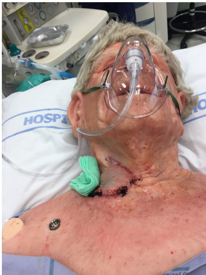
Figure 1 Simulated patient for NetworkZ training.

period. We called our programme ‘NetworkZ.’ There are 20 District Health Boards (DHBs) in NZ and an estimated 5000 qualified OT staff, including anaesthetists, surgeons, nurses and anaesthetic assistants. We divided these 20 DHBs into four cohorts, matched for DHB size, and began introducing the training to one cohort per year. Our implementation goal is that DHBs will independently run their own NetworkZ courses after 12 months of central support, and that all NZ OT staff will attend a NetworkZ course at least once in 5 years. This