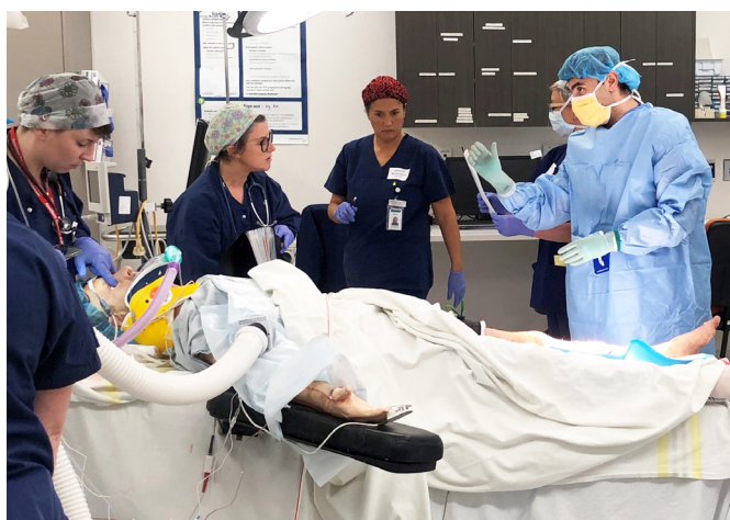
Figure 2 Multidisciplinary in situ simulation training underway.

period. We called our programme ‘NetworkZ.’ There are 20 District Health Boards (DHBs) in NZ and an estimated 5000 qualified OT staff, including anaesthetists, surgeons, nurses and anaesthetic assistants. We divided these 20 DHBs into four cohorts, matched for DHB size, and began introducing the training to one cohort per year. Our implementation goal is that DHBs will independently run their own NetworkZ courses after 12 months of central support, and that all NZ OT staff will attend a NetworkZ course at least once in 5 years. This