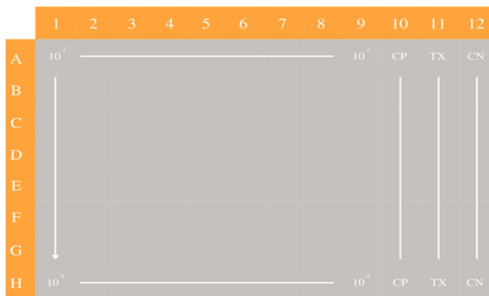
Figure 2 Titration plate scheme: TCID 50 (Median Tissue Culture Infectious Dose), performed in microplate of 96 wells, where in the first line were added 9 wells with virus samples in a dilution equal to 10^{-1} , in the second line a dilution equal to 10^{-2} and so on, up to line 8 with dilution of 10^{-8} . In column 10, positive control (CP) was added, in which Vero 81 cells were infected with viral solution, in column 11 (TX) only the MouthWash 0.1% APD or Dental Gel 1% APD (dilution that does not cause cytotoxic effect) was added with cells and culture medium, and in column 12 all wells were treated only with cells and culture medium (Negative Control – CN).

contact of the products (Dental Gel 1% APD, Mouthwash 0.1%) with the viral solution of SARS-CoV-2. It is emphasized that a microplate of 96 wells had been used for each compound and the respective contact times (Figure 2). From these samples, dilutions of the viral solution at base 10 were made in replicates in sterile microplates of 96 wells, in dilution factors from 10^{-1} to 10^{-8} , and dilutions were conducted with DMEM (Dulbecco's Modified Eagle's Medium) with 2% of bovine serum (inactivated). Microplates in desired confluence of Vero ATCC ® CCL-81 ™ with a concentration of 2 \times 10^5 cells/well with DMEM (Dulbecco's Modified Eagle's Medium) with 2% bovine fetal serum (inactivated) were prepared for the dilutions of the assays of different contact times of the product. The microplates were incubated in an incubator with 5% CO 2 for one hour under agitation, so that viral adsorption occurred. Subsequently, each microplate well was washed with 200 \mu L of buffered saline solution (PBS), with consequent addition of 200 \mu L DMEM (Dulbecco's Modified Eagle's Medium) with 2% bovine fetal serum (inactivated) and 1% antibiotic-antimycotic. For positive control, only the viral solution and the previously specified cell concentration were used. The microplates containing the viral solution after contact with the products and cell system were incubated at 37° C in an incubator with 5% CO 2 for 72 hours, after this