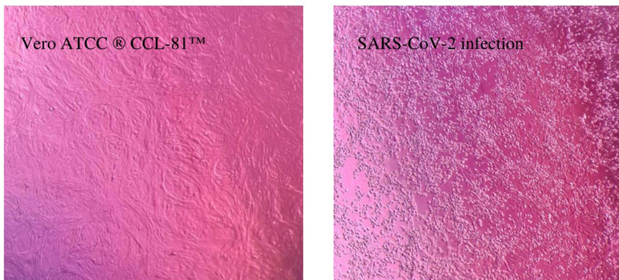
Figure 1 SARS-CoV-2 infection in cell culture. On the left, an uninfected cell line; on the right: SARS-CoV-2 infection in cell culture of Vero ATCC CCL-81 (Fiocruz, BR).

In order to determine concentrations of the products that did not cause cytotoxic effect and that could not provide incongruous interpretations to distinguish artifacts from cytopathic and cytotoxic effects, it was observed that