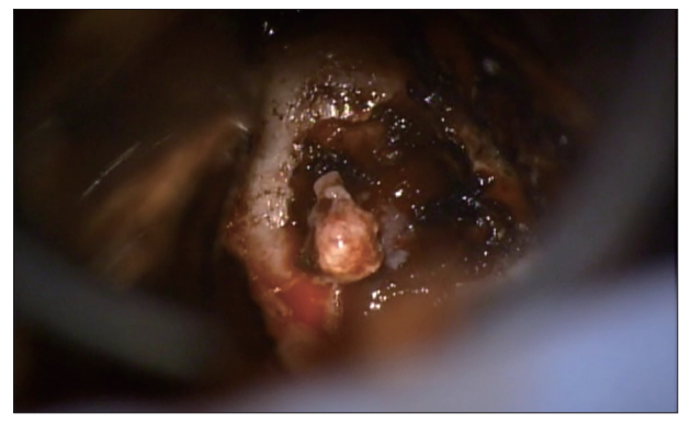
Fig. 2. Pituitary mass during the operation. The contents and colors were just similar with pituitary adenoma.

The patient underwent CyberKnife treatment for the remnant