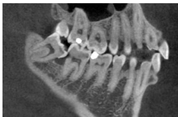
Figure 2. External root resorption of the lower second molar.

The presence of ERR was evaluated by navigating the volume of CBCT and exploring all sections of the second molar in all dimensions and was recognized as an apparent loss of substance on the distal surface of the adjacent second molar root. Suspicion of resorption was registered if a contact was seen between the third and second molars in addition to a change in the shape of the surface of the second molar (Figure 2). External root resorption of adjacent second molars was differentiated from carious lesions based on their radiographic appearance: in all cases where the change in the shape of the surface of the second molar was observed, but there was a clear gap between second molars and the dental crown of the third molar, this lesion was diagnosed as caries, and the tooth was recorded as free of ERR.