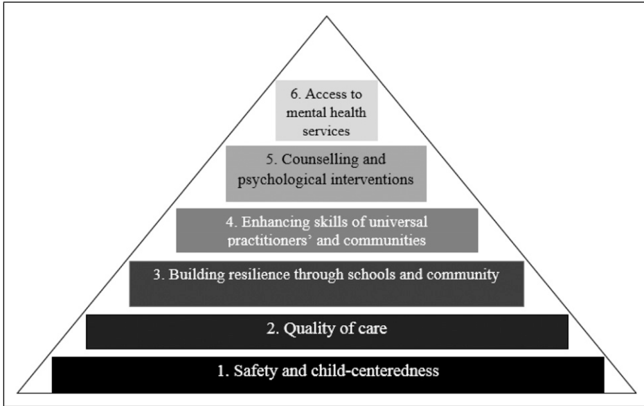
Figure 3. Service transformation framework (Vostanis et al., 2019a).