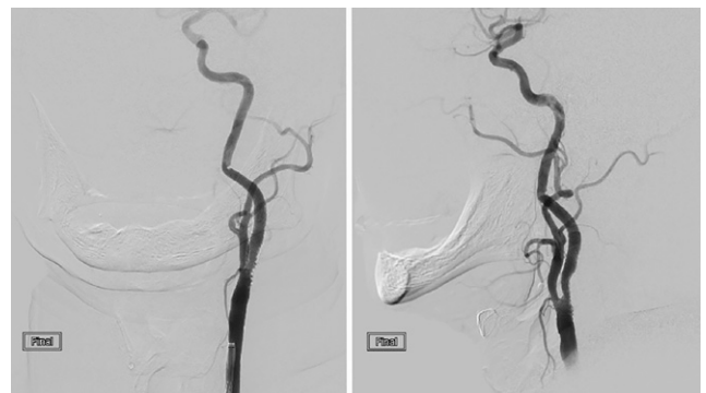
FIG. 3. Left: Frontal angiography of the left ICA showing no residual stenosis and no thrombosis. Right: Lateral view.