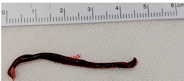
FIG. 2. The 45-mm red clot was removed from the left MCA after endovascular thrombectomy.