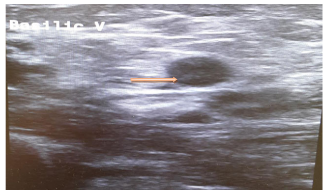
Figure 3: Ultrasound scan of the basilic vein with evidence of thrombus formation.