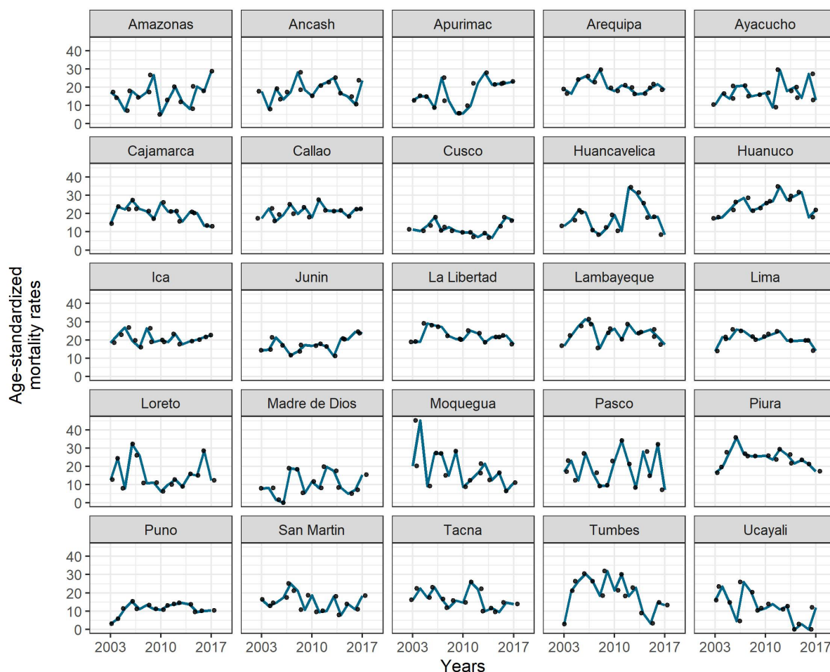
Figure 2. Age-Standardized Mortality Trends Per 100,000 Men-Year for Prostate Cancer in Peruvian Provinces between 2003 and 2017.