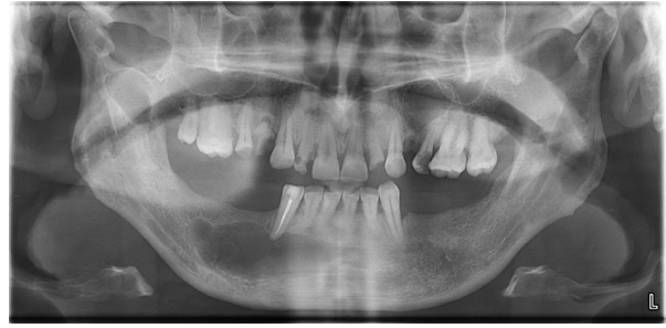
Fig. 3. Panoramic view of the patient after the removal of the ectopic third molar and other cysts.

enucleated the other cystic lesions located in the maxilla and mandible, were enucleated without any complications. They sent the enucleated soft tissues were sent to pathology and sutured the wound after irrigation. The pathology report revealed tissue compatible with a dentigerous cyst around the ectopic tooth; radicular cysts in the maxilla; residual cyst in the mandible.