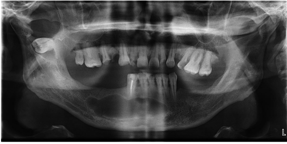
Fig. 1. Panoramic view of the patient before the surgery.