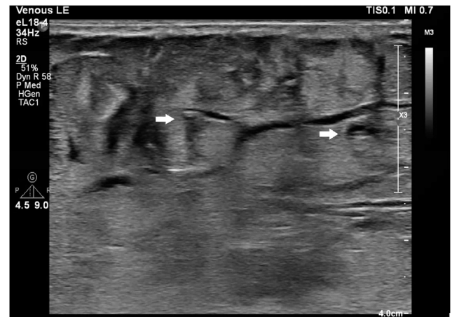
Figure 2. Veins without foam sclerosant after tumescent anaesthesia (arrows).

venospasm. A compression dressing or bandage is applied to include all the micro-incisions.