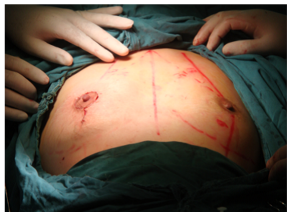
Fig. 3 Symmetry of both sides after surgery

Wide local excision and breast flap reconstruction were completed in all patients. The average operative time