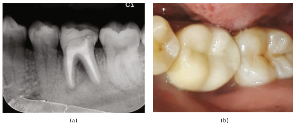
FIGURE 3: One-month postoperative evaluation: (a) postoperative radiograph; (b) Ceramage® onlay for restoration.

resin cement (Figure 3(b)). The evaluation after one month showed negative on subjective examination and the percussion and palpation test. The radiograph showed bifurcation, and apical radiolucency was reduced.