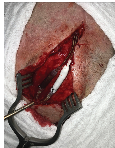
Figure 2: Exposure of the leads and connectors. Debridement and release of adhesions.

syndrome, cluster headache, and refractory partial epilepsy, was found to bear a higher incidence of hardware-related infections than the most usual and established indications such as Parkinson's disease and other movement disorders. [16]