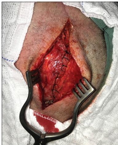
Figure 3: Anteriorization of connectors and the extensions and placement underneath the splitted temporal muscle. Implants involved and wrapped by the temporal muscle with topical vancomycin powder and secured with unabsorbable nylon sutures.

In a prospective analysis of 144 patients who underwent DBS, Constantoyannis et al. reported that straight incisions on the scalp increased the risk of infection compared with curvilinear incisions. [8] Zhou et al. also proposed a modified skin incision to reduce skin-related complications. The double C-shaped incision was compared with the traditional incision and was shown to successfully reduce the incidence of skin complications. [28]