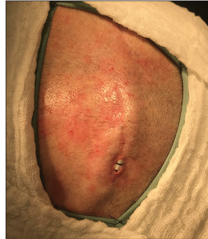
Figure 1: Skin erosion at the connector's site.

DBS is an effective and established treatment for movement disorders. [2,12,18-20,27] Any surgical procedure with implants carries a risk of complications derived from the foreign body inserted in the patients. DBS procedures introduced a new series of possible complications related to its hardware. Infection, malfunction, lead migration, or system fracture can increase patient morbidity and should be considered when assessing and also consenting patients with regard to risks/benefits of this therapy. [7,10,14] The use of DBS for less frequent indications or conditions, such as Tourette's