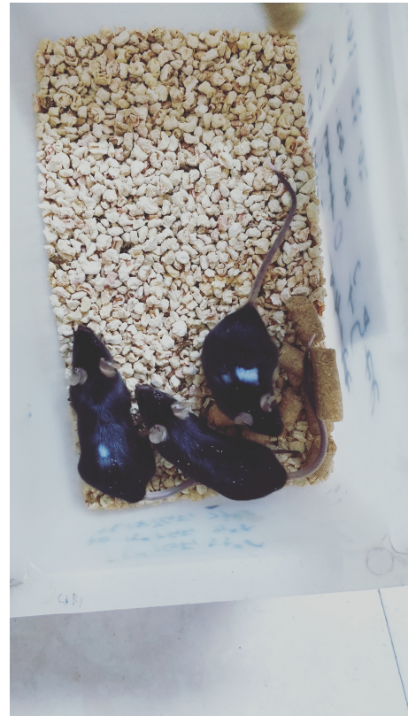
Figure 1. Mice in the experimental group.

Total RNA was extracted using TRIzol Reagent (Life Technologies, Inc., Gaithersburg, MD, USA) in accordance with the manufacturer's instructions and stored at -80^{\circ}\text{C} . The purity and integrity of RNA was evaluated via electrophoresis, ethidium bromide staining, and optical density (OD) absorption ratios OD260 / OD280 and rRNA (28S / 18S).