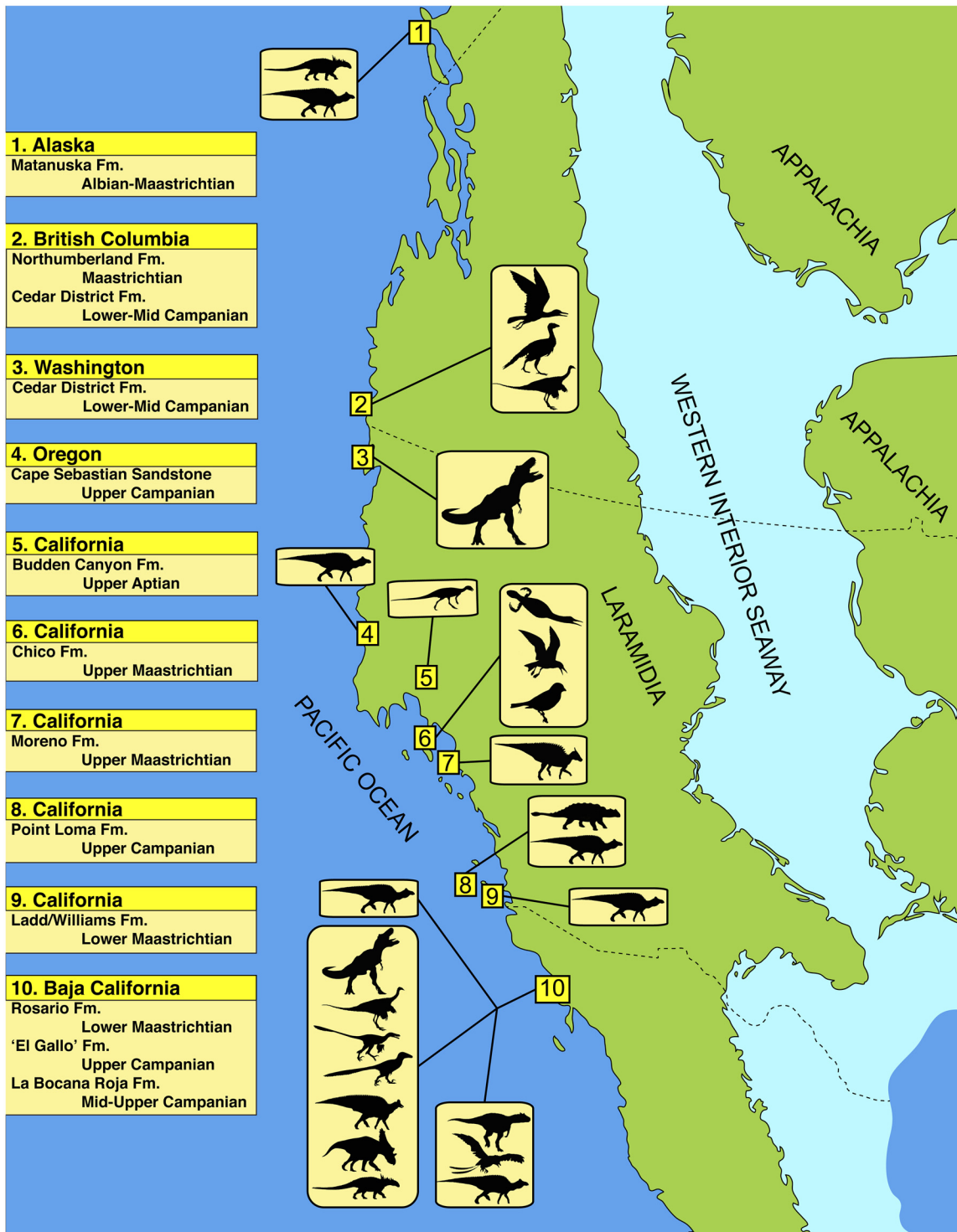
Fig 1. Geographic overview of Late Cretaceous dinosaur assemblages from the west coast of Laramidia. The specimen described here was collected from Campanian rocks at Sucia Island (Washington State), but these strata were probably deposited at a more southern latitude, perhaps as far south as the 'El Gallo' and La Bocana Roja formations of Baja California, Mexico. See Discussion for overview of specific taxa from each formation. Dinosaur assemblage data were gathered from the following sources: Matanuska Formation [13–15], Northumberland Formation [16, 17], Cedar District Formation [16], Cape Sebastian Sandstone [2, 18], Chico Formation [19, 20], Budden Canyon Formation [21], Moreno Formation [22, 23], Point Loma Formation [24–26], Ladd Formation [2], Rosario Formation [6], 'El Gallo' Formation [6, 22, 27–32], La Bocana Roja Formation [33, 34]. Silhouettes modified from images available on Wikimedia Commons.