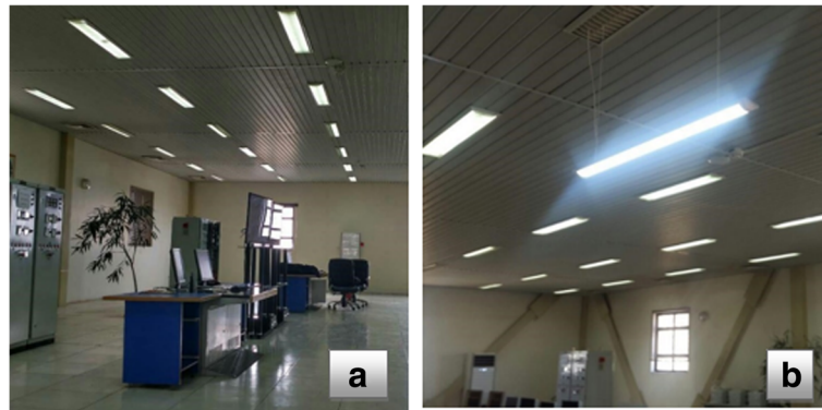
Fig. 2 View of the room before and after the intervention ( a. before the intervention, b. after the intervention)

through intervention caused significant changes in the values of the performance indicator and the percentage of the contrast.