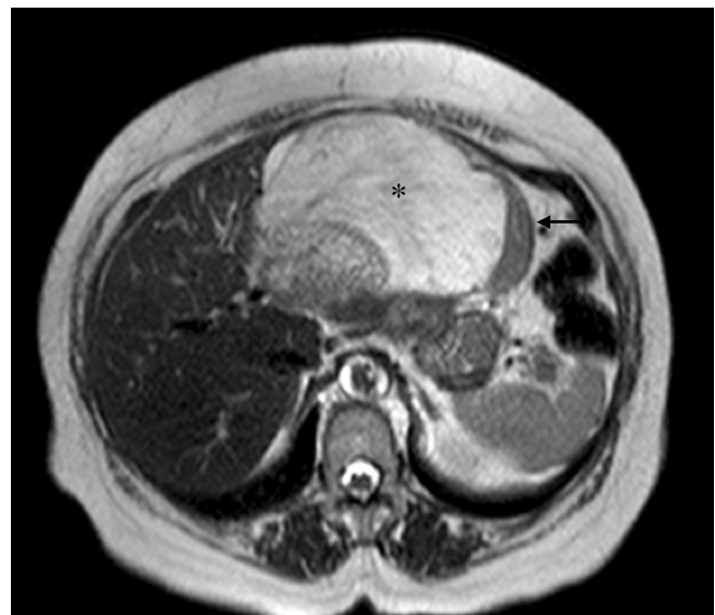
Figure 2 MR imaging sequence with T2-weighted transversal. Imaging shows a hypointense signal originating in the peripheral region (arrow) and a dominant component associated with a hyperintense signal (*).

Surgery and pathological analysis revealed a hepatic segment measuring 17.5 × 14 × 8 cm and weighing 1200 g that contained a 15 × 9 cm brown tumor with ill-defined limits. The tumor had a gelatinous component and showed hemorrhaged, necrotic, and cystic areas. The final