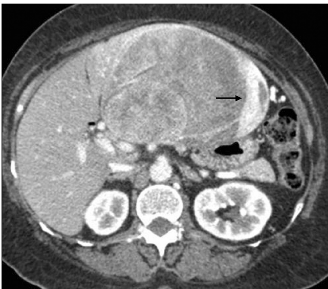
Figure 1 Portal-stage contrast-enhanced helical CT of the upper abdomen. Impregnation by the contrast agent shows a large, solid, exofitic lesion compromising the left liver lobe. The enhancement is intense and heterogeneous, the dominant portion being in the periphery of the lesion (arrow).

Computed tomography (CT) of the upper abdomen (Figure 1) showed a heterogeneous lesion – measuring 15 × 14 × 10 cm – with a partially well-defined margin and hypodense permeating areas, some with attenuation values compatible with soft parts, and others with liquefaction located in the left liver lobe. After endovenous contrast injection, the lesion showed intense and non-