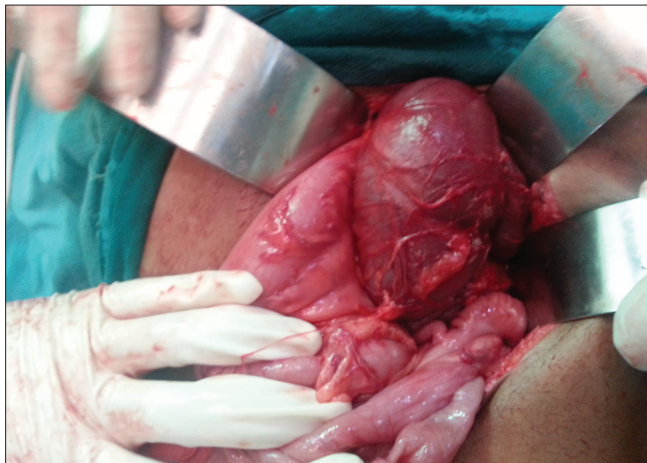
Figure 2: Intraoperative picture showing a tubular fluid-filled structure displacing the bowel loops