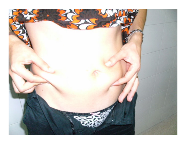
Fig. 2 The different "pinch" characteristics of normal ( left ) vs lipohypertrophic ( right ) tissue

varies significantly. In five recent studies it ranged from lowest to highest: 14.5% (Hajheydari et al. [8]); 27.1% (Raile et al. [9]); 34.5% (Partanen and Rissanen [10]); 48.0% (Kordonouri et al. [11]); 64% (Blanco et al. [12]). Blanco et al. studied 430 patients from 19 Spanish centers and found that LH was more common in T1DM (72.3%) than in T2DM (53.4%). Grassi et al. [13] studied 388 patients from 18 Italian centers and found a prevalence of 48.7%. A Chinese study [14] of 401 patients in four centers found an overall prevalence of 53.1% (95% CI 48.2, 58.0%). By body site, LH was found in 52.4% of abdomens examined, 15.5% of thighs, and 9.4% of arms.