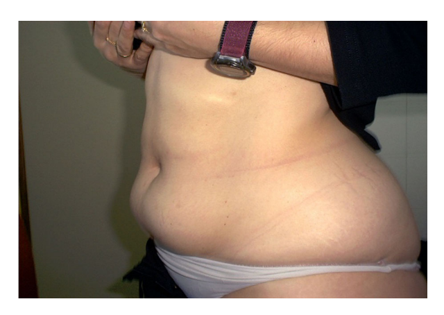
Fig. 1 Two visible lipohypertrophic lesions below the umbilicus

Of some consolation is that Indian patients with LH do not inject into these lesions as frequently as in ROW (Table 4). When asked why they continued to do so, convenience and pain were less frequently cited by Indian patients