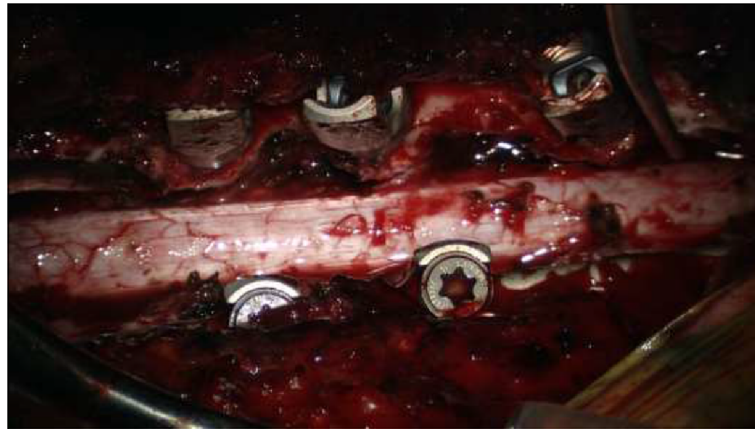
Figure 2 Intra-operative view. Intra-operative view of the surgical field showing completely decompressed dural tube, widely resected facet joints, and inserted pedicle screws.

wine color or dark brown appearance contrasts well with the normal epidural fat [2]. Increased body weight and pregnancy appear to exacerbate the symptoms because of changes in the tumor mass and volume [2].