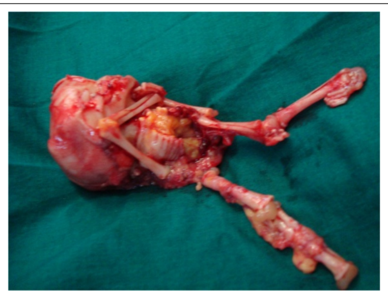
Figure 4 Lithopedion after extraction.

in 1.5 to 1.8% of these cases (Costa et al. 1991; Frayer and Hibbert 1999).