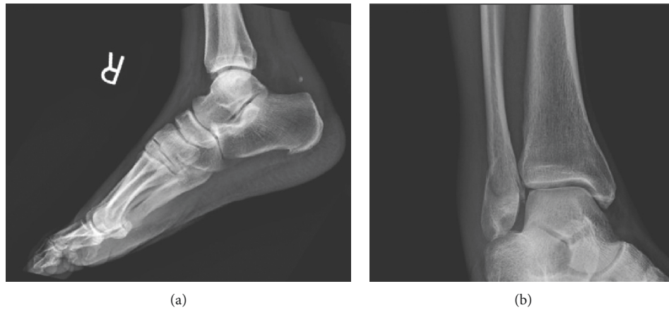
FIGURE 1: Plain radiographs: (a) lateral view and (b) mortise view.