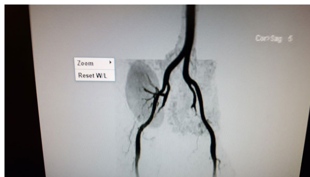
Figure 2 Magnetic resonance angiogram of allograft kidney with end-to-side anastomosis using the internal iliac artery, and distal blood flow beyond anastomosis.

Another case was a 25-year-old male with chronic kidney failure due to glomerulopathy. We performed end-to-side anastomosis using the hypogastric (internal iliac) artery with good results (Figure 3). His creatinine level was 1.5 mg/dL after 2 months. He was treated with tacrolimus, CellCept® (mycophenolate mofetil), and prednisolone.