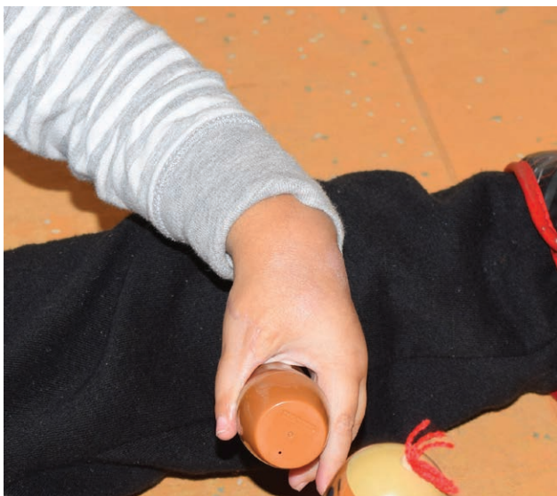
Fig. 3. Postoperative image of the patient gripping an object using pollicized thumb.