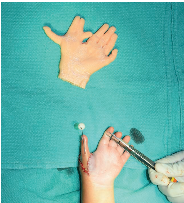
Fig. 2. Intraoperative image of the silicone soft-tissue model above with the repaired hand below.

ing the first, second, and fourth digits and retaining and pollicizing the second digit of the mirrored hand. The first, third, and fourth digits were amputated through their metacarpal bases. A mid-shaft osteotomy of the second digit metacarpal was then performed. A K-wire was then placed through the proximal phalanx through a hyperextended metacarpal head onto the proximal metacarpal stump. The abductor pollicis brevis, located during the dissection of the first digit, was transferred to the base of the proximal phalanx of the second digit. The interosseous muscles of digits 2 and 3 were combined