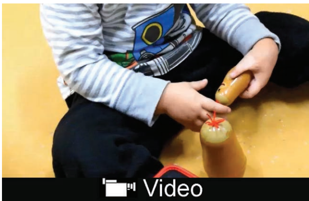
Video Graphic 1. See video, Supplemental Digital Content 1, which demonstrates the function of the reconstructed left mirror hand immediately postoperative, http://links.lww.com/PRSGO/A898 .

ever, our experience is that the process is only marginally more labor and time intensive than 3D printing alone.