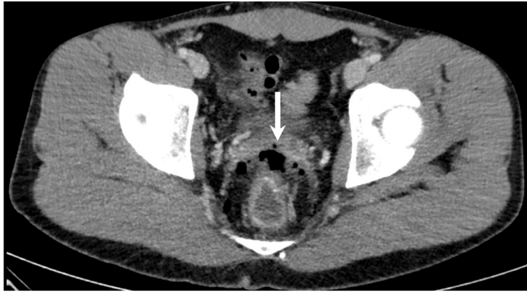
Fig. 1. Gas contained in soft tissue anterior to rectum (arrow)