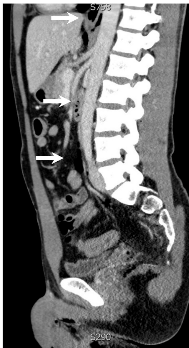
Fig. 3. Contained gas tracking up small bowel mesentery (arrows).

underlying significant co-morbidities [7,8].