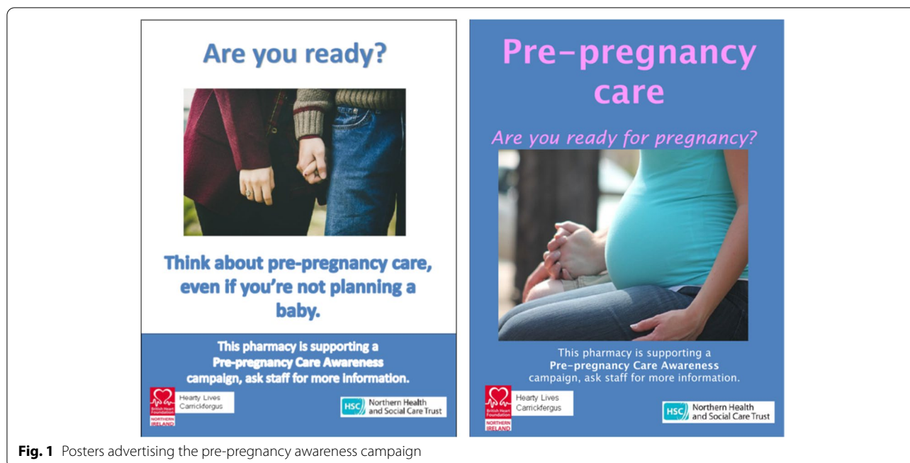
Fig. 1 Posters advertising the pre-pregnancy awareness campaign

information and local services (Fig. 2), and a crib sheet (standard operating procedure) to guide staff through the interaction with customers (Fig. 3).