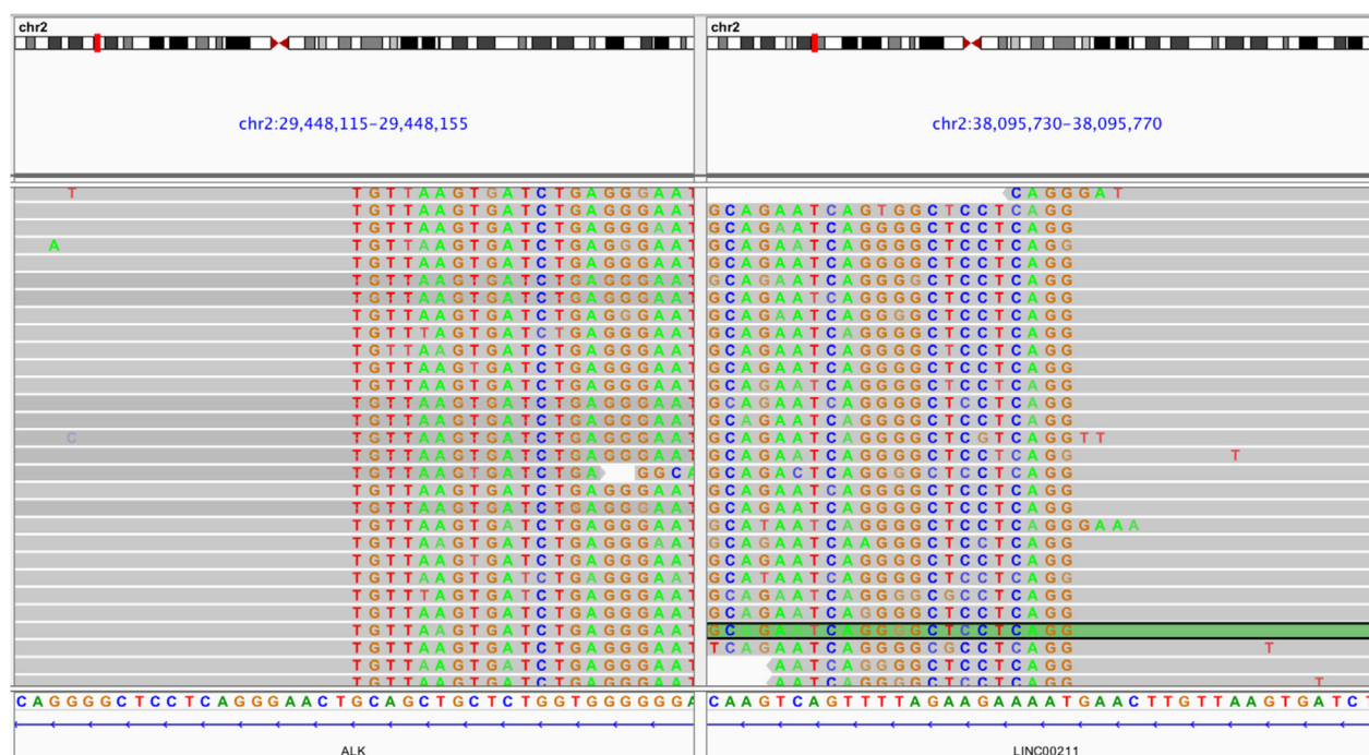
Figure 2 Illustration of the LINC00211-ALK fusion detected from the CSF sample of the patient at PD from crizotinib therapy. The breakpoints are in chr 2:29448134 for ALK and chr 2:38095752 for LINC00211. Each gray row represents the sequencing read from a DNA fragment. Bottom bar shows the DNA sequence annotation of ALK (left) and LINC00211 (right).

demonstrated the clinical value of CSF-based liquid biopsy as a viable specimen for guiding precision treatment, particularly in the diagnosis and treatment monitoring of patients with either primary or metastatic CNS tumors. 8,9 In our patient, instead of the classic EML4-ALK rearrangement, two concurrent non-EML4-ALK rearrangements previously unreported to respond to alectinib or any other ALK inhibitors were detected in her CSF samples but were not detected in her plasma samples. Further analysis revealed that the ALK kinase domain was not retained in LOC388942-ALK , while LINC00211-ALK has the breakpoint in the intron 19 of ALK and thus retained the critical ALK kinase domain (Fig 2). By collectively considering all the clinical evidence including the stable primary lung lesion, the absence of mutations detected in the plasma samples, the absence of radiologically observable change, the presence of at least one ALK fusion detected from CSF samples potentially responsive to alectinib, the increased intracranial pressure, and the presence of CNS progression-related clinical symptoms, the care team confirmed the failure of alectinib therapy at 300 mg and decided on escalating the dose to 600 mg and again from 600 mg to 900 mg bid. Increasing the alectinib dosage ensured that adequate concentration penetrated into the CNS thus enabling the reversal of the drug tolerance and prolonging the duration of response to alectinib in our patient. Upon