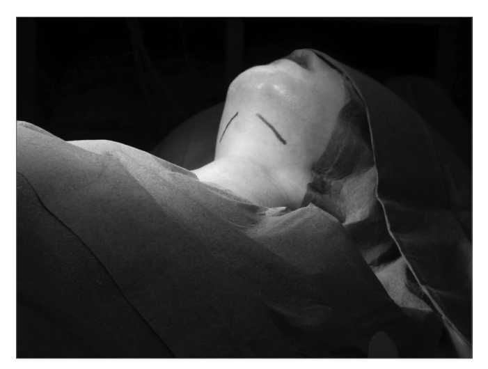
Figure 2. Incision topography for submandibular gland exeresis (submandibular region).

gland duct and the secretory branch of the lingual nerve for the gland must be ligated; and the SM gland is removed. (Figures 2 and 3)