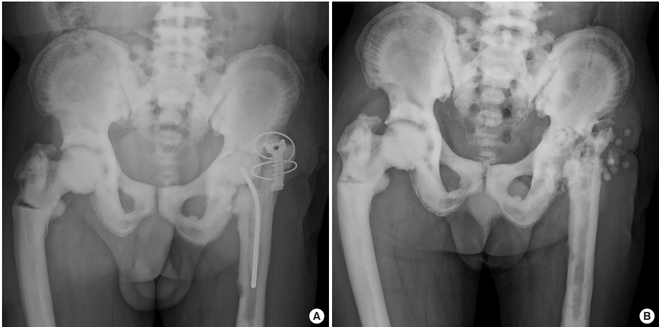
Fig. 1. (A) An anteroposterior view of the pelvis obtained at the time of injury shows a right transverse subtrochanteric fracture and osteosclerotic appearance of the osteopetrotic bone. The patient suffered a postoperative infection after surgery of left femoral neck fracture. (B) Radiographs at 4 years after injury shows a healed right subtrochanteric fracture with coxa vara. The chronic osteomyelitis of left hip finally treated with Girdlestone operation.

myelitis were also evaluated.[12] Descriptive statistics were reported as median and range for continuous variables and as total number and percentage for discrete variables. The design and protocol of this study was approved by the