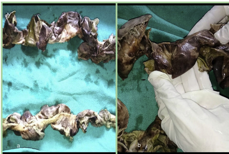
Fig. 3. Gross specimen of gut showing gangrenous bowel comprising of jejunum and ileum with marked blackened and thinned out areas in bowel wall.