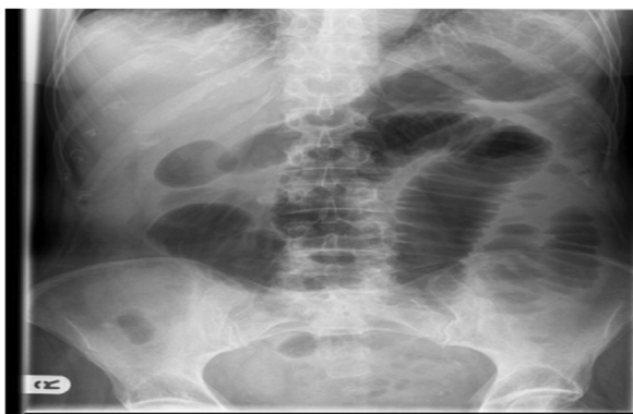
Fig. 1. X-ray of abdomen show multiple dilated small gut loops in central part of abdomen.

ine 10 mg stat, injection MgSO 4 loading followed by maintenance. Vital charting was done; patient had persistent tachycardia during next 4 days. All baseline investigations were sent. Subsequently, on Day 5 of admission patient developed abdominal distension with absence of bowel sounds and also complained of numbness in left arm. On examination of pulses: right sided radial artery volume was good but low volume was noticed in left sided radial, brachial, bilateral dorsalis pedis and posterior tibial artery. Right arm B.P – 128/70 mm of Hg, Left arm B.P – 80/60 mm of Hg. Abdomen was diffusely tender. Probable diagnosis of sepsis with intestinal obstruction was made.