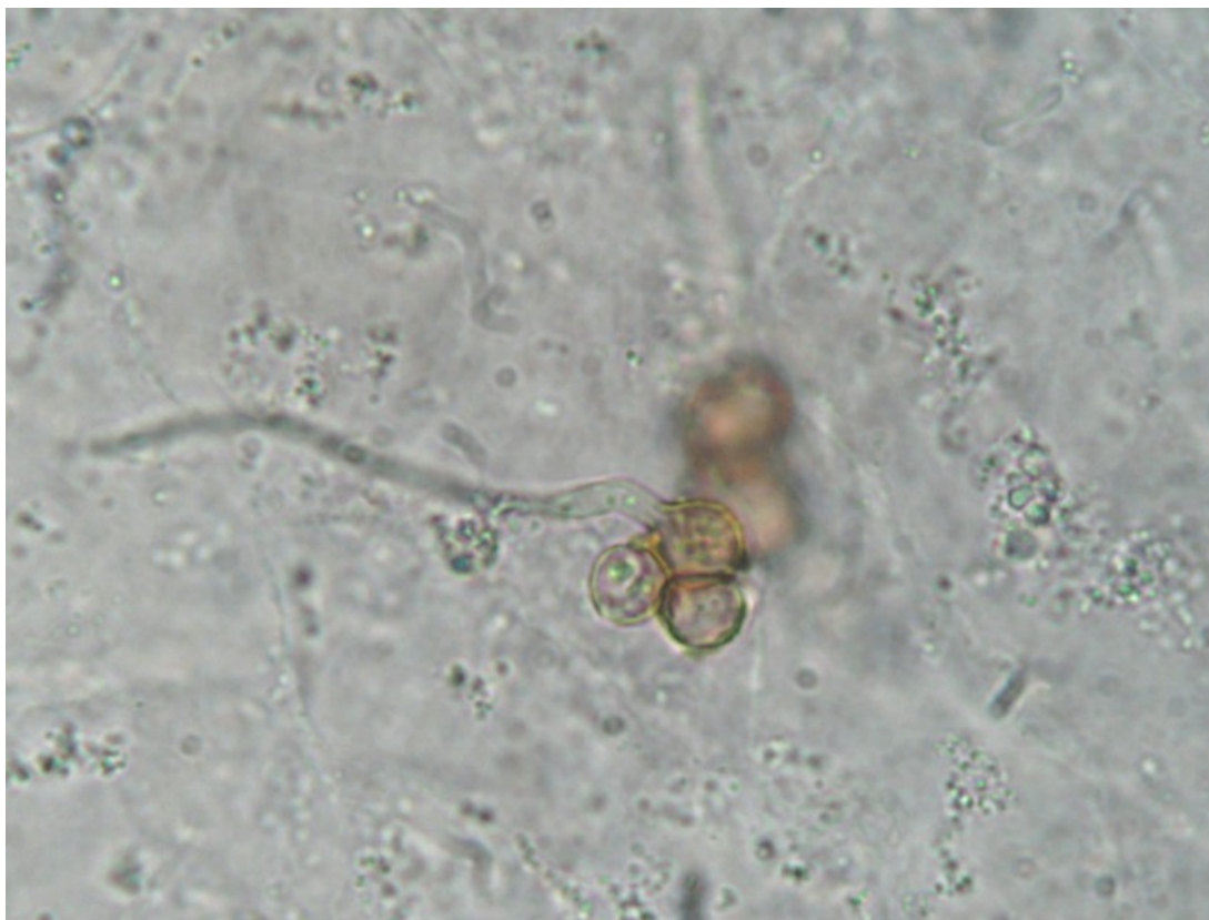
Figure 4 Sclerotic cells with hyphae (10% potassium hydroxide technique).