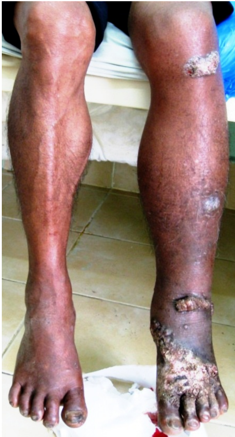
Figure 1 Lower legs of the patient at presentation with typical lesions on his left foot that spread centripetally up to his knee.

identified as third instar larvae of the Old World screw-worm fly, Chrysomya bezziana (Diptera: Calliphoridae) [8]. Due to the pathognomonic microscopic findings of sclerotic cells he was diagnosed with chromoblastomycosis and started on itraconazole 400 mg/d monthly