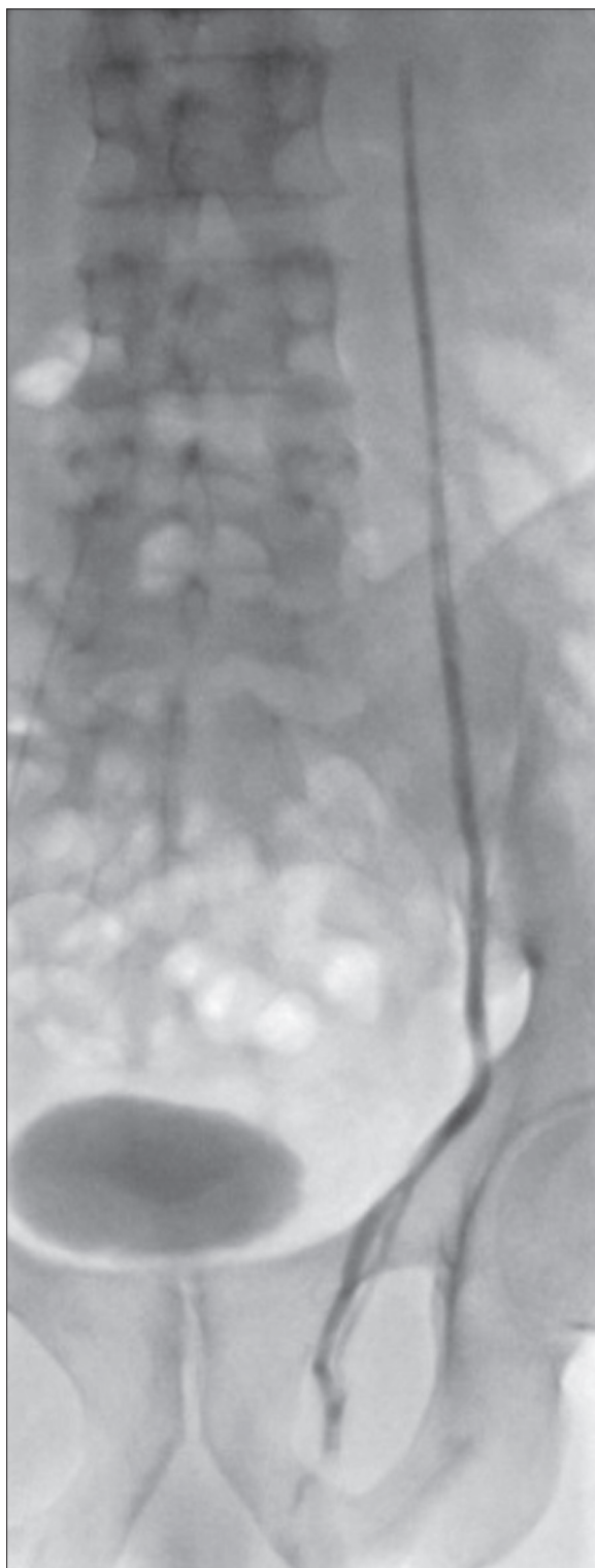
Figure 3. Final control, single shot of glue in occluded vessels.

of 17 patients, preventing save follow-up phlebographic examination. Single images taken after the compression of the puncture site revealed no migration of glue within the spermatic vein compared to the images obtained immediately after glue injection. No periprocedural complications were reported. Three patients reported discrete pain in the region of a palpable, elongated thickening within up to 72