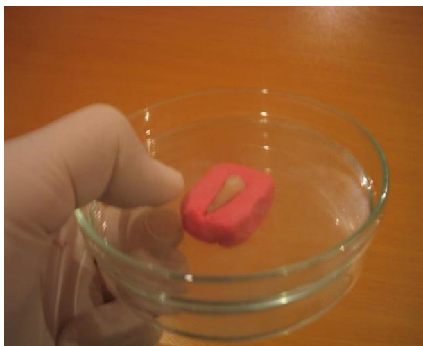
Fig. 1: Applying pressure on the tooth by a second plate in order to position the buccal surface parallel to the horizon

The inclusion criteria consisted of maxillary and mandibular premolars of patients aged 13-19 years with a normal anatomical form and sound enamel, without any cracks, fractures, caries or fluorosis, and with no history of surface treatment with chemical agents (such as bleaching treatment with hydrogen peroxide). The specimens were evaluated under a stereomicroscope (SNZ1000, Nikon, Tokyo, Japan) at \times 38 magnification to ensure that all the teeth met the inclusion criteria. The teeth were stored in saline at 4^{\circ}\text{C} for one month.