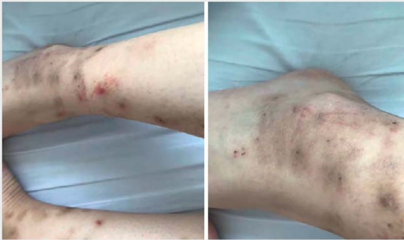
► Fig. 1 Petechiae, ecchymoses, and palpable rashes were observed in the distal part of both her lower limbs.