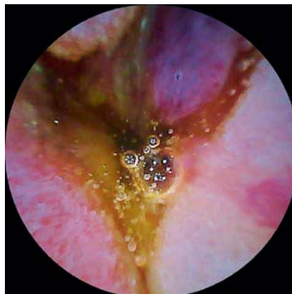
► Fig. 4 Purpuric lesions fusing with each other to form large hemorrhagic blisters in the proximal small bowel.

A young woman presented with vomiting after eating shrimp and abdominal pain predominantly around the umbilicus and upper abdomen. Physical examination revealed epigastric and periumbilical tenderness without rebound tenderness. Petechiae, ecchymoses, and palpable rashes were observed in the distal part of both lower limbs (► Fig. 1 ). Laboratory tests revealed an increase in