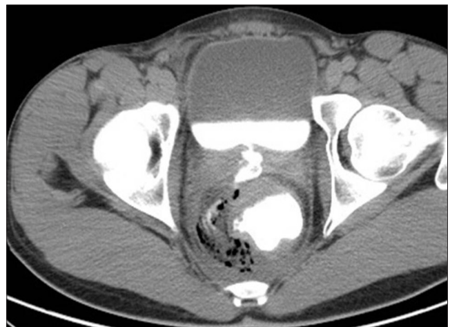
Figure 1: RU showing a connection between the anterior wall of the rectum and posterior wall of the urinary bladder

A previously healthy 15-year-old boy presented to University Hospital Hassan II of Fez. Three hours ago, he had fallen onto the handlebar of the bicycle and sustained a penetrating injury of the rectum. The patient and his parents reported copious watery drainage expelled per rectum. No sign of hematuria was reported as he had not voided since the trauma. Upon arrival at our emergency room, the patient complained only of pelvic pain and inability to void. No abdominal