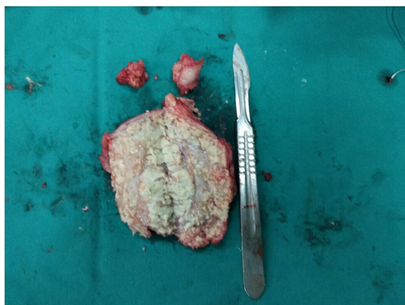
Fig. 2. Tubercle in gross specimen.