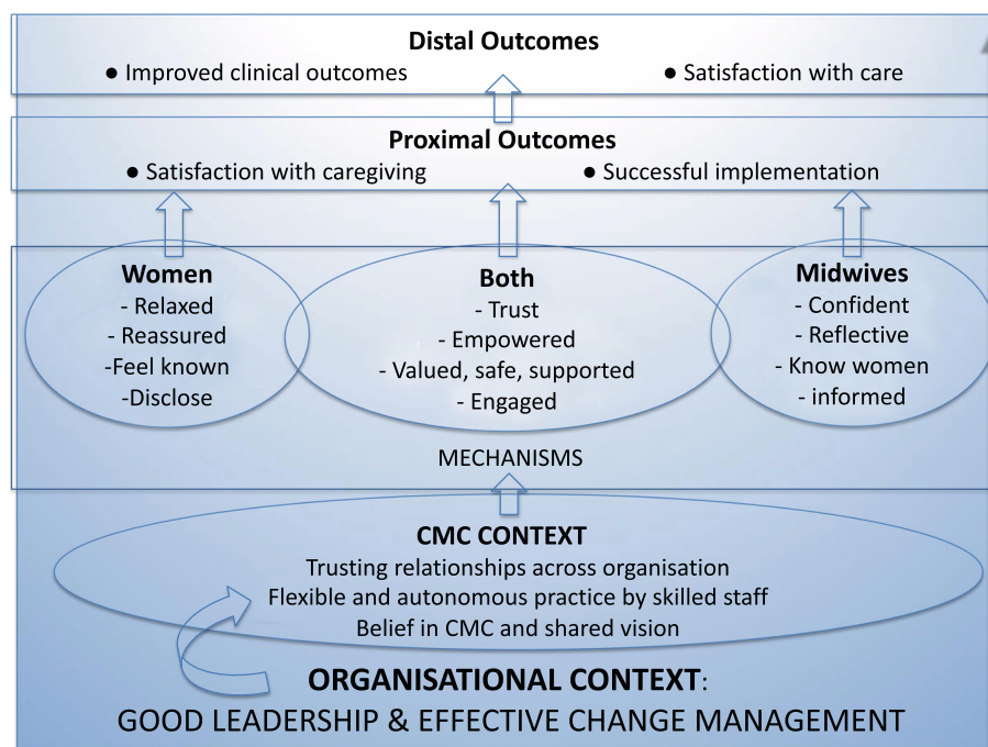
Fig. 2 Refined programme theory

Effective leadership is essential for developing trusting relationships, the context in which CMC flourishes. Trusting relationships are the foundation on which CMC is built and become the cement that holds it together over time. Relationships matter, not only because women want them, but because it is the woman-midwife relationship that triggers change in women’s behaviour [69] and midwives’ practice resulting in better outcomes and care giving experience. The importance of woman-midwife relationships are already recognised, as are the supportive, sustaining and enabling relationships between midwives within CMC teams [48]. However, our study also suggests that good leadership operating across