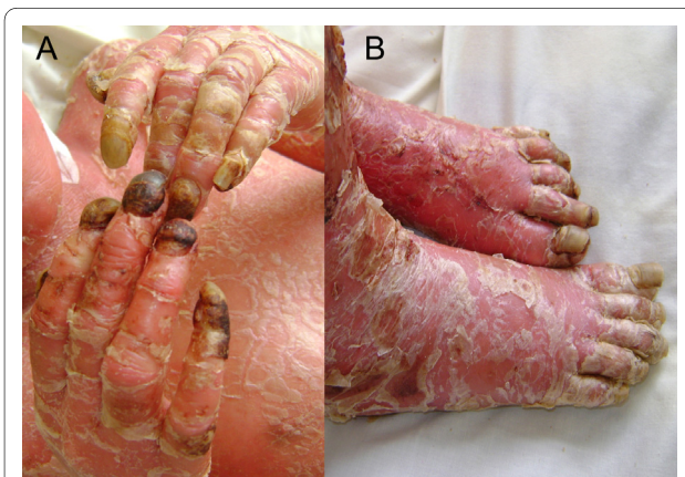
Figure 2 Severe onychodystrophy in our patient's (A) fingernails and (B) toenails.

The initial management of our patient's condition included systemic treatment with methotrexate, fluid resuscitation, and well-controlled food intake. At the