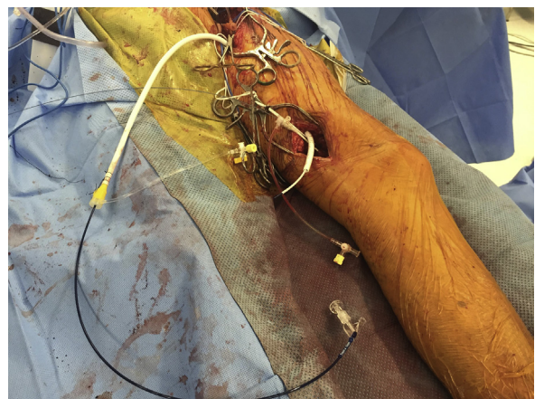
Fig 2. This representative image from a similar case illustrates the technique of loading a Viabahn stent graft through a tunneled polytetrafluoroethylene (PTFE) bypass conduit.

The 0.035-inch wire in the popliteal artery was back-loaded into the Viabahn, and the Viabahn was advanced through the popliteal artery such that it was both in the popliteal artery and partially within the tunneled PTFE graft. This stent graft was deployed and angioplastied throughout to 6 mm. Several interrupted 6-0 Prolene sutures were then used to secure the PTFE graft to the popliteal artery. Care was taken to avoid puncture of the Viabahn as the PTFE coat is thin, making hemostasis difficult. Next, femoral endarterectomy was performed with patch angioplasty. The proximal graft was then sewn in a standard fashion to the patch. Completion angiography demonstrated excellent inflow with inline flow to the popliteal artery with a patent PTFE graft-popliteal Viabahn stent graft.