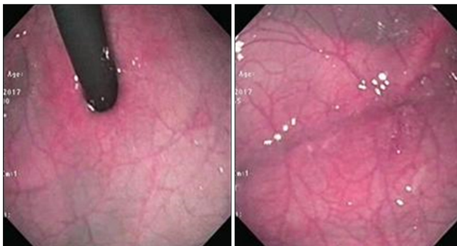
Fig. 2. Control endoscopy images.

GIS hemangiomas may occur in association with