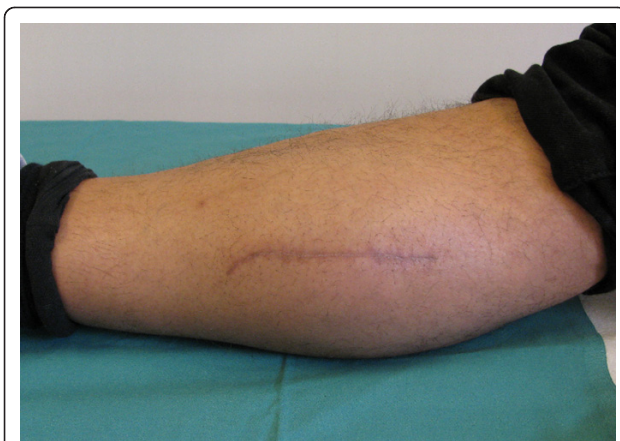
Figure 3 Follow up three months postoperatively. Scar over the right medial gastrocnemius without bulging or signs of inflammation.

Six months after surgery, the patient was admitted to our out patient clinic by his general practitioner because of recurrent pain in the same leg. In the examination this pain appeared rather to be of radiating character, however. An MRI of the lumbar spine showed osteochondrosis of L3/L4 and, subsequently, an infiltration of the L3 root brought pain relief.