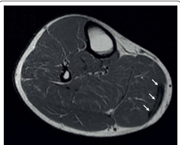
Figure 1 MRI of the right lower leg. Arrows pointing at a superficial hypointense lesion of proximal third of the medial gastrocnemius muscle.

The operation was performed under general anaesthesia with the patient supine. First, the muscle herniation was