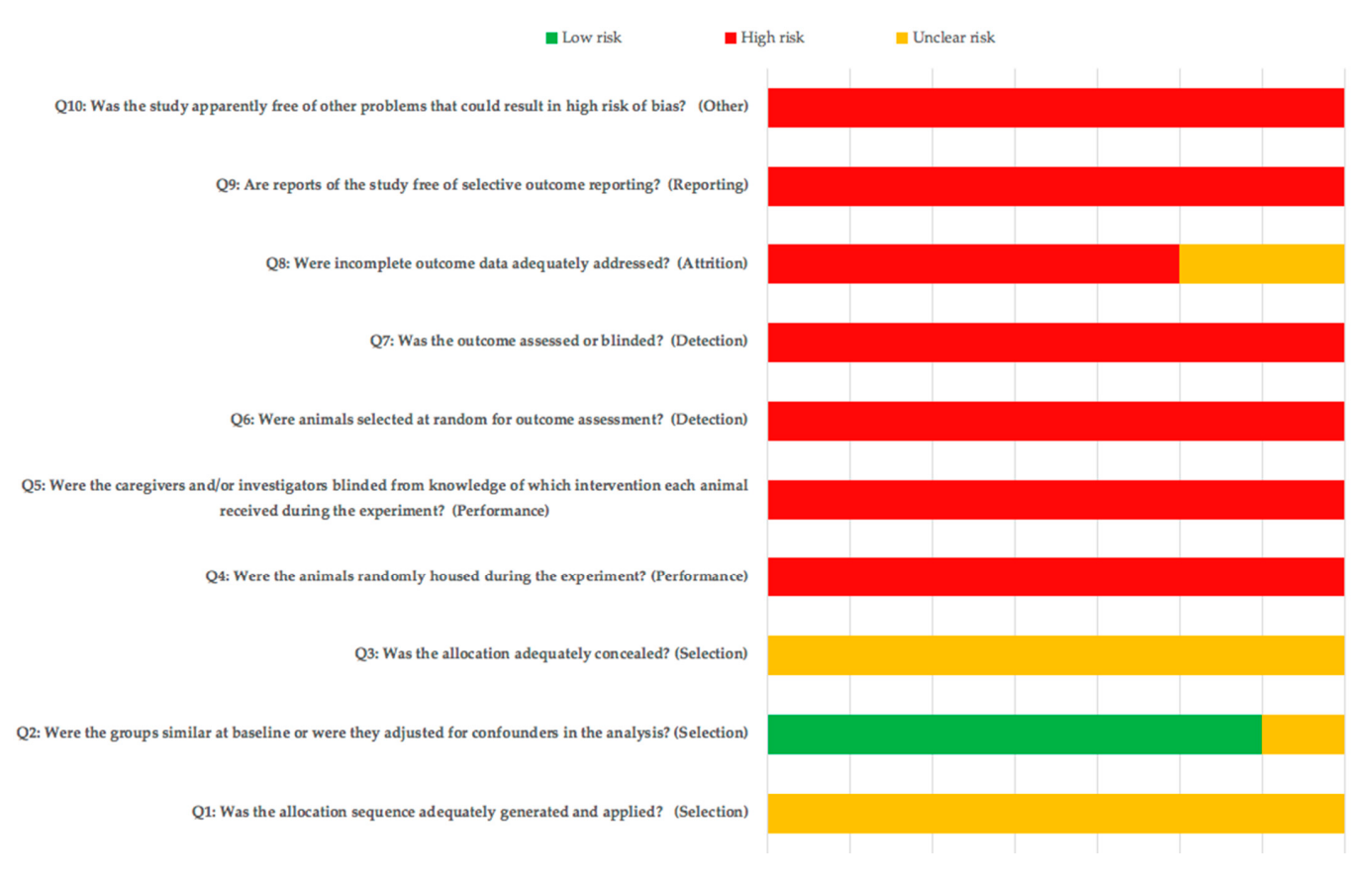
Figure 3. SYRCLE's (Systematic Review Centre for Laboratory animal Experimentation) risk of bias tool.

The risk of bias assessment results for the animal studies are shown in Figure 3. Although allocation to blinding was mentioned in several articles, the lack of information on the method used resulted in a high and unclear risk of bias for most items. Table 1 shows the ARRIVE guidelines checklist for the animal studies included. The mean score for the studies was 17.14 \pm 0.63 . All of the studies reported correctly on the title, abstract, introduction, ethical statement, species, surgical procedure, outcomes assessment, and statistical analysis. Items 5 (reasons for animal models), 13 (assignment of animals to experimental groups), 19 (3Rs, Replace, Reduce and Refine.) and 20 (adverse events) were not reported in any of the included studies; only the study by Bhattarai et al. (b) reported limitations in terms of clinical applicability.