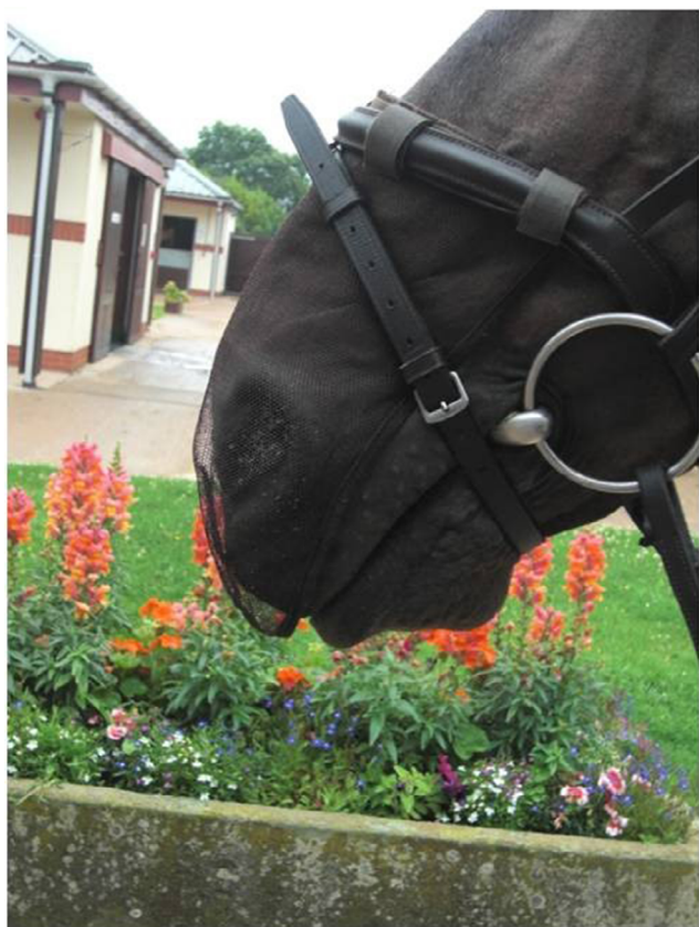
Figure 1 Horse wearing a nose net.

There are drugs available for the treatment of neuropathic pain in people and some of these have been used in trigeminal-mediated headshakers to see if their neuropathic pain could be managed this way. Even in people with neuropathic pain, these drugs have inconsistent results and may confer side effects including drowsiness. A challenge to the efficacy of neuropathic pain is the heterogeneity of the