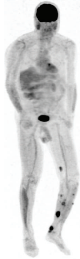
FIGURE 1: PET scan obtained to evaluate and stage the extent of histologically confirmed local recurrence of left lower leg soft tissue sarcoma.

investigating potential local recurrence [18] (Figure 1). In a recent publication evaluating the diagnostic and prognostic value of the PET/CT in sarcoma, it was found that the test is highly sensitive and specific in the detection of high-grade bone and soft tissue sarcoma but had a low positive predictive value for evaluation of nodal metastases [19]. Furthermore, it was found that the SUVmax of the primary tumor was a strong predictor of survival [19].