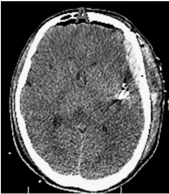
Fig. 4 Post-op CT.

without previously documented valvular heart disease developing. 5,6