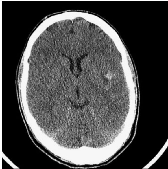
Fig. 1 CT of the head with Fisher IV subarachnoid hemorrhage (SAH).