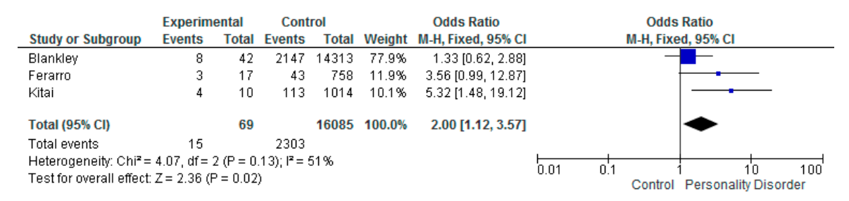
Figure 3. Meta-analysis of studies and low birth weight.

Three of the included studies reports on low birth weight, with the results ranging from OR 1.33 (CI 0.62–2.88) [41], OR 3.56 (CI 0.99–12.87) [26], and OR 5.32 (CI 1.48–19.12) [61]. The meta-analysis of OR's (Figure 3.) indicated a raised risk of low birth weight of the babies born to women with personality disorder. Overall OR 2.00 CI 1.12–3.57 (p = 0.02). The heterogeneity between these studies was ( I^2 = 51\% ).