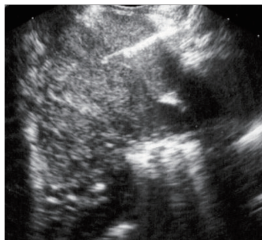
Figure 3. EUS image showing the puncturing of the left atrium's tumor with a 19 G needle (Cook®).