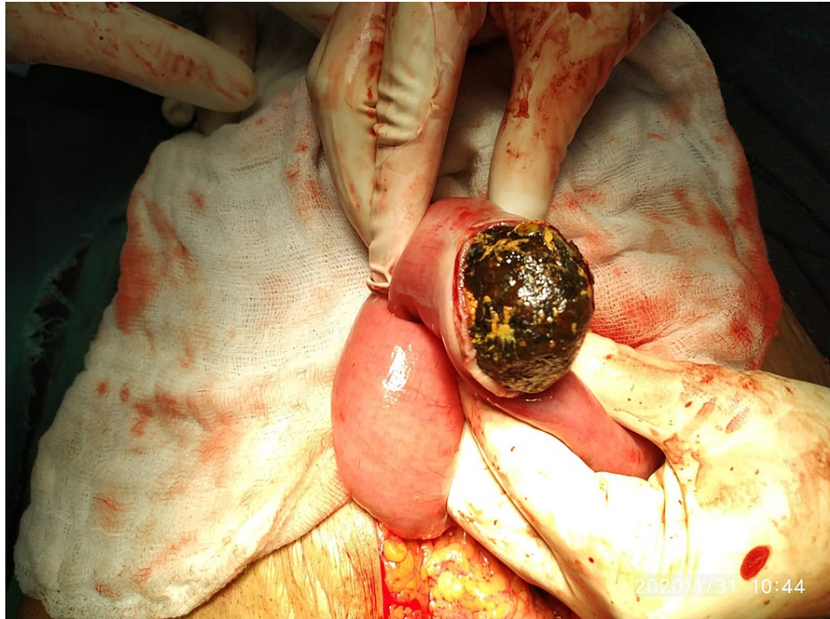
FIGURE 4: Gall stone retrieved through enterolithotomy