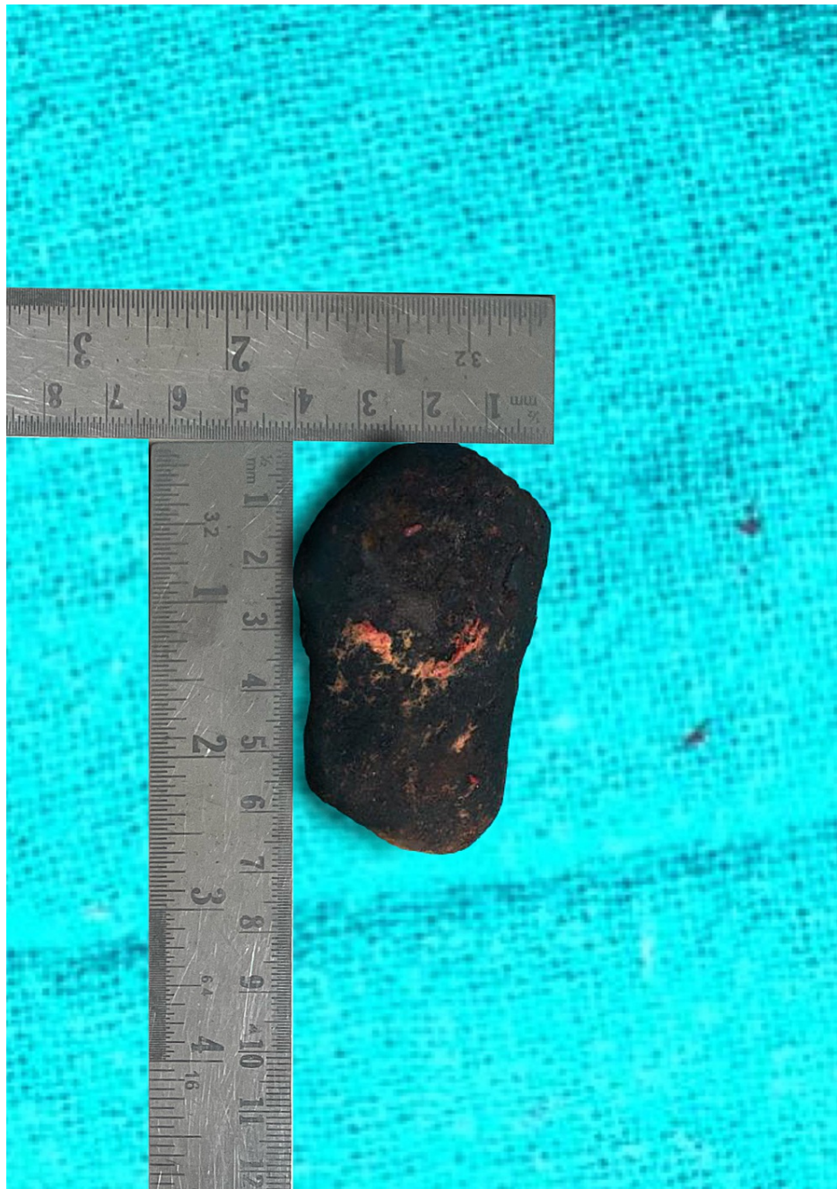
FIGURE 5: Gall stone retrieved from the distal ileum

Patients with gall stone ileus very rarely present with gall stone-induced pancreatitis; only three cases have been published so far. However, our patient with gall stone ileus presented with a prior history of gall stone-induced pancreatitis. According to the available literature, a plausible reason for this is that the stone was causing external compression at the ampulla, as seen in the case of Bouveret syndrome, and this could be the reason for the initial presentation of the patient [11].