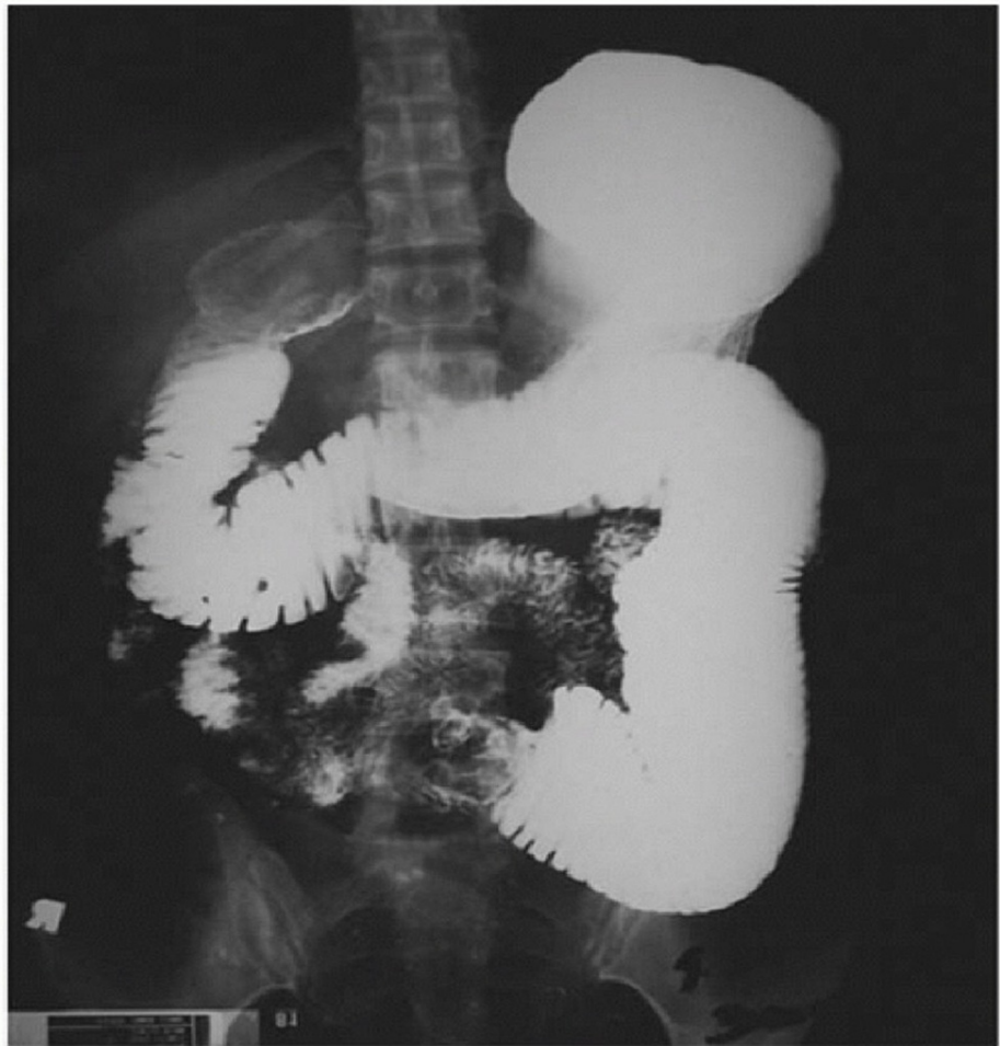
FIGURE 2: Barium meal follow-up of the patient showing luminal obstruction of the small bowel

Two weeks after undergoing barium meal follow-through, the patient developed recurrent episodes of vomiting and non-passage of flatus and feces with abdominal distention. On examination, the patient was tachycardic and the abdomen showed signs of peritonism. After adequate resuscitation, erect and supine X-rays of the abdomen were done. These revealed multiple air-fluid levels with dilated small bowel loops and no pneumoperitoneum. In view of recurrent episodes of obstruction and the presence of peritonism, the patient was taken up for exploratory laparotomy.