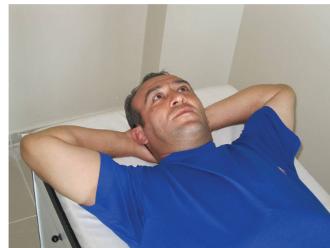
FIGURE 2: Pectoral muscles shortness test.

Supraspinal Skinfold Thickness. Thickness of skinfold between thumb and index finger at 5 cm superior and medial of spina iliaca anterior superior was measured with the Scinfold Caliper device.