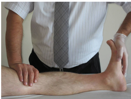
FIGURE 4: Gastrocnemius muscle shortness test.