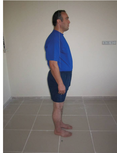
FIGURE 1: Postural assessment (lateral analysis) balance type.

Waist Circumference/Thigh Circumference Ratio. Results of waist and thigh circumference measurements were proportioned. Whether there was a statistically significant relationship or not was analysed.